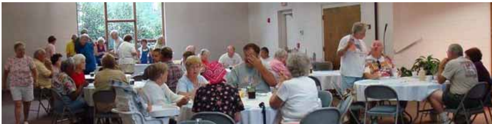
Below: Missions Committee Pancake Breakfast held prior to the parade.