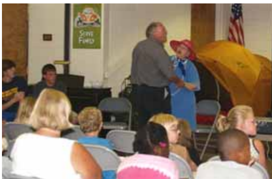
Top Left: Vacation Bible School ends each day with a play performed by the youth and a few adults. Granny is always in the play. All of the children love Granny. They love her "fried chicken" too! The play portrays the daily Bible lesson in a way that the children can relate it to everyday living.