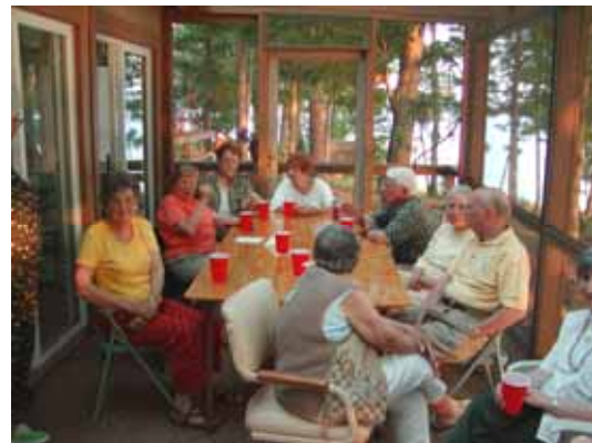
Above: Folks relaxing on the Merchant's porch after enjoying a wonderful fellowship dinner.