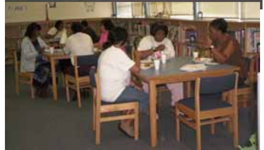
Above: The LUMC Outreach Committee served breakfast to the teachers at McIver Elementary.

A BIG THANK YOU to all who helped make this day special for the teachers.