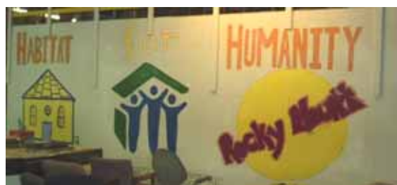
Above: Wall Art / Habitat For Humanity Rocky Mount

the service, the Lunch Bunch crew fed them lunch along with members of the Mission Committee and Admin Council. On Sunday evening, the team visited with the youth group at Littleton Baptist Church. One third of the team helped frame a house for the Halifax/Northampton Habitat affiliate. The house is located near Gaston, north of Roanoke Rapids. The remainder of the group worked on painting and construction projects at the Rocky Mount Habitat affiliate warehouse. The teens worked so hard that by Wednesday afternoon they had completed five days of work at the Gaston project. On Thursday the entire team worked at Rocky Mount and completed all of that work as well. On Friday, the Canadian team spent several hours at the John 3:16 Center assembling a swing-set and picking up broken glass from the playground. Some Littleton UMC members helped provide meals during the week, as did other churches and the Habitat affiliates. On Tuesday evening the team enjoyed an NHL hockey game in Raleigh. On Friday evening they attended a youth revival service at Oak Grove Baptist Church. After a full and busy week, they returned home to Canada, back to cold weather, with hearts warmed by "Southern hospitality."