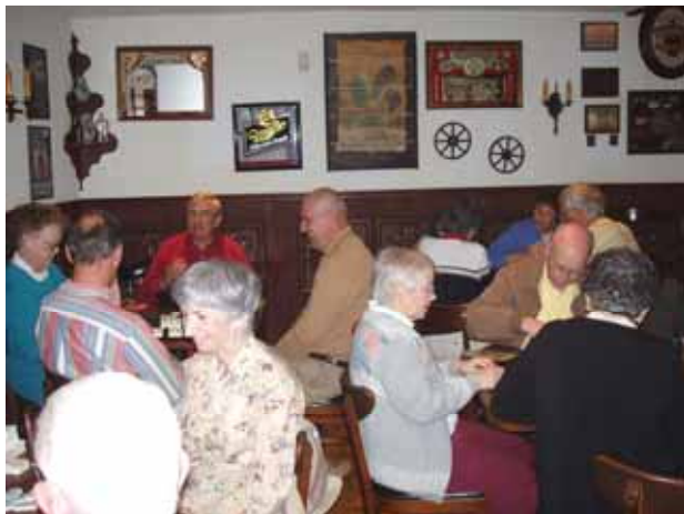
Above: LUMC Members enjoy Game Night at Mordecai's.