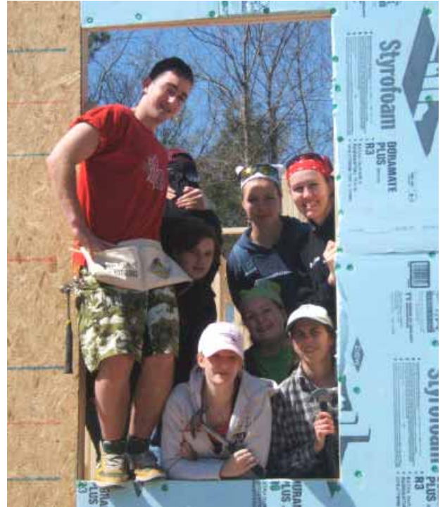
Pictured Above: Youth Mission Team at Habitat House